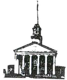
ART TREASURES IN ST. JOSEPH CATHEDRAL